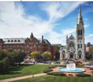
Saint Louis University's campus.