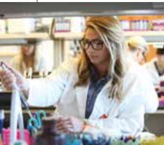
BioSTL supports St. Louis' bioscience and health care industries.