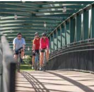
One of Great Rivers Greenways' bike trails.

open rooftop bar and poolside lounge chairs offer one of the best views of the city's riverfront and skyline.