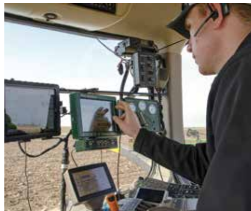
ABOVE, FROM LEFT: World Wide Technology's global headquarters; Express Scripts' research lab; Bayer's Crop Sciences division focuses on plant breeding, biotechnology, crop protection and data science.