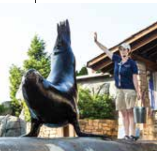
Sea lion show at the Saint Louis Zoo.

There are 100 free exhibits at the Economy Museum inside the historic Federal Reserve Bank of St. Louis. Play Trading Pit, a game that lets visitors act as “buyer” or “seller.” Enjoy a video sneak peek of the 90,000-pound vault door that protects the real money and even learn how many dollar bills it takes to equal the height of the Gateway Arch. Beginning in June, visitors will be able to lift a 28-pound gold bar that is worth $500,000. This will be the only exhibit of its kind in the United States, says museum director Tom Shepherd.