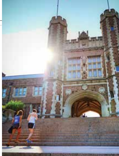
CLOCKWISE FROM FAR LEFT: Students at Maryville University; Washington University; Washington University commencement; Saint Louis University's iconic gateway.