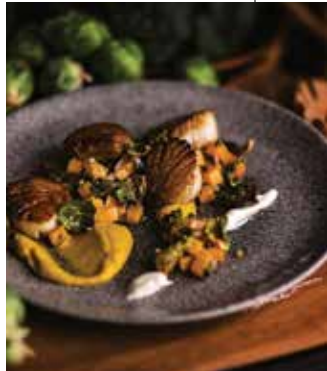
Seared diver scallops at The Chocolate Pig.

For those traveling with little ones, map out your adventures using Goodnight St. Louis , a whimsical children’s book that not only features the region’s most popular landmarks and neighborhoods, but also doubles as a memory album where kids can add mementos, notes and photos from their trip.