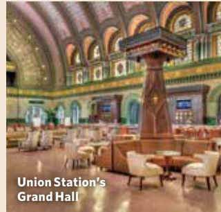
Union Station's Grand Hall

Love the arts? Then the Angad is for you. The colorfully hued hotel, located in the heart of the Grand Center Arts District, is an immersive visual, culinary and performing arts experience. Book your room by emotion: tranquility blue, happy yellow, passionate red or green rejuvenation. The hotel is steps away from more than 12,000 theater seats representing 50 arts organizations.