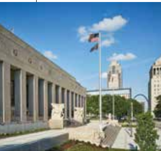
Soldiers Memorial Military Museum in downtown St. Louis.