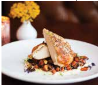
Chicken with preserved lemon and sage jus, beurre blanc and squash hash at Pop.

Remember to remove your earbuds before you visit the Delmar Loop . Voted one of the “10 Great Streets in America” by the American