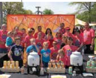
The Republic of Tea team members.

The mayor's list is just the beginning. Part of the historic Union Station train depot is being transformed into a family entertainment complex that includes an almost $200 million aquarium. The Saint Louis University Hospital on SLU's south campus is being rebuilt and a new mixed-use development, Iron Hill, will bring the "perfect blend of high-density development that the area needs," says Pestello.